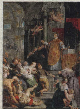
866 Peter Paul Rubens (1577-1640), The Miracles of St Ignatius of Loyola , circa 1617-1618, Flemish.